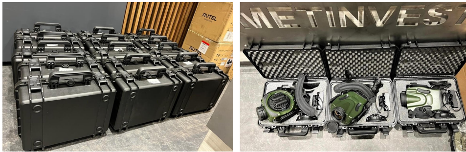
Recently, the military received new scarce equipment from Metinvest: 15 satellite artillery-fire guidance systems

In addition, the Group has supplied 268 vehicles, including 20 ambulances, and 500,000 litres of fuel to the army. To provide additional protection for front-line vehicles, the military can also receive special steel. As well as plates for bulletproof vests, Metinvest-SMC ships them free of charge on official request. And more than 31,000 first aid kits and tourniquets are helping to save the lives of defenders on the front.