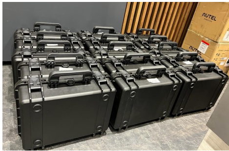
Recently, the military received new scarce equipment from Metinvest: 15 satellite artillery-fire guidance systems

In addition, the Group has supplied 268 vehicles, including 20 ambulances, and 500,000 litres of fuel to the army. To provide additional protection for front-line vehicles, the military can also receive special steel. As well as plates for bulletproof vests, Metinvest-SMC ships them free of charge on official request. And more than 31,000 first aid kits and tourniquets are helping to save the lives of defenders on the front.