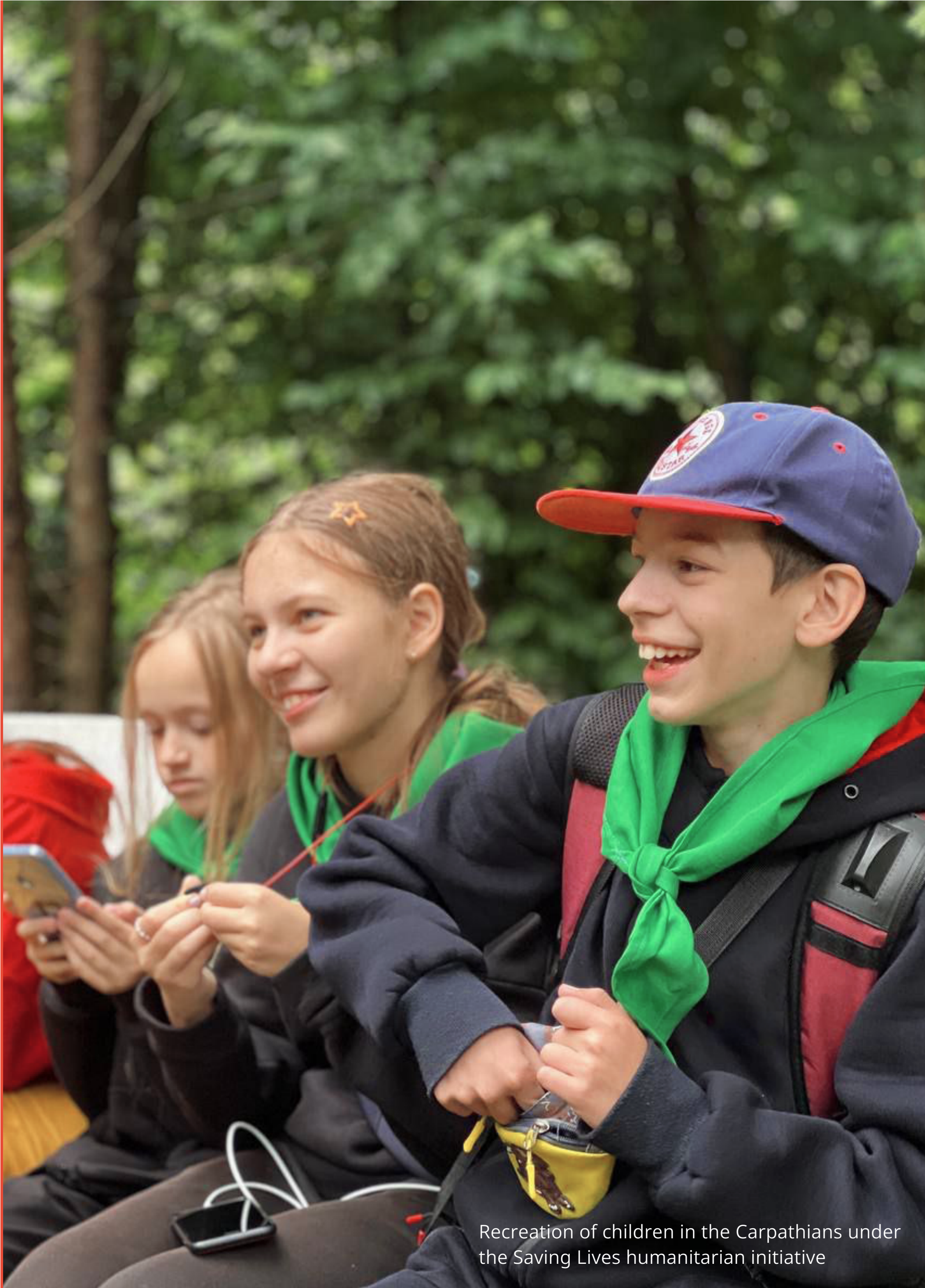
Recreation of children in the Carpathians under the Saving Lives humanitarian initiative

During 2022-2024, Metinvest allocated around US$9 million in medical aid, delivering essential medications, equipment and supplies to hospitals across Ukraine. Psychological recovery continued to be a central aspect of the Group’s healthcare support. This priority was exemplified by the Unbreakable Mum programme, which offered intensive three-week therapeutic retreats for nearly 400 women and children directly affected by military hostilities. Through a dedicated psychological rehabilitation programme for children within Saving Lives, 545 youngsters from vulnerable groups visited the Carpathians (Ukraine) under the guidance of psychologists. Additionally, 120 children engaged in Hibuki therapy (mental health therapy support for children affected by trauma), and 12 attended a sports camp in Genoa, Italy. In addition, more than 16,000 psychological support sessions were conducted at the Oplich Hub in Zaporizhzhia, a joint initiative of Saving Lives and the UN Global Compact Ukraine. Metinvest also supported ongoing professional training via an online education platform, enabling around 10,000 specialists in prosthetics and rehabilitation to enhance their skills.